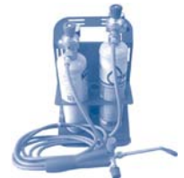
N6010 Brazing Turbo Set 200